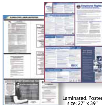
Laminated. Poster size: 27" x 39"

Find I-9s, W-4s, employee applications and the latest Federal and State labor law changes at accountedgechecks.com . Supply us with your E-mail address and we will send you the latest updates.